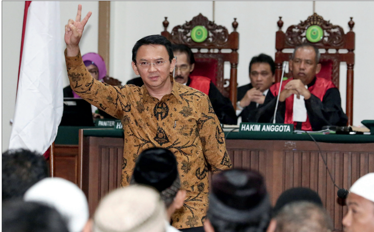
Jakarta's Governor Basuki Tjahaja Purnama, also known as Ahok, gestures inside the courtroom during his blasphemy trial at the auditorium of the Agriculture Ministry in Jakarta, Indonesia, January 3, 2017. [In May 2017, Ahok was convicted of blasphemy and sentenced to two years in prison.]

belief—transcend borders. (For more information, refer to the “Common and Crosscutting Challenges” section.) In short, a note from the secretary-general for the 71st session of the UN General Assembly about the elimination of all forms of religious intolerance succinctly captures the responsibilities countries have to the international community: