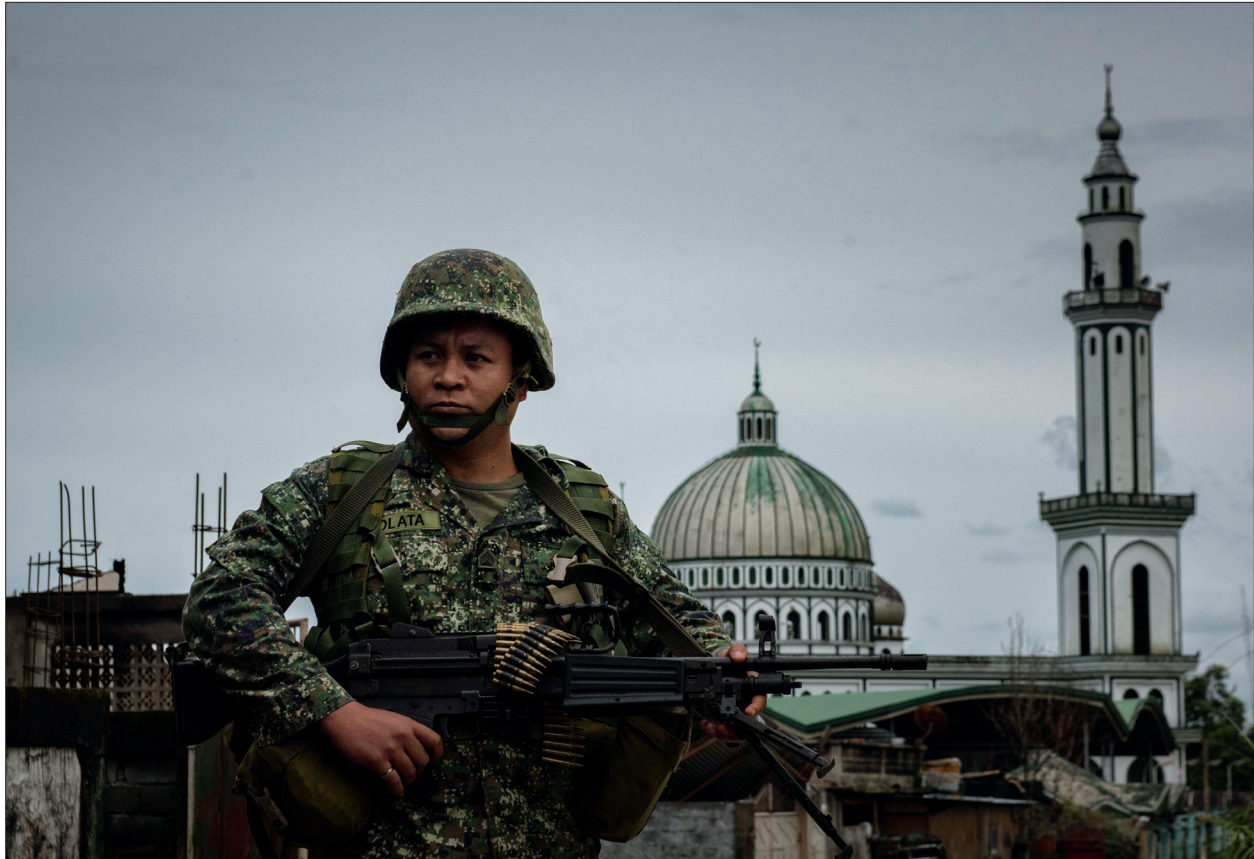
MARAWI, PHILIPPINES - JULY 22: A soldier walking past a mosque on July 22, 2017 in Marawi, southern Philippines. The Philippine Congress voted [that day] to extend martial law in the southern part of the country since it was imposed to crush a rebellion by Islamic State-inspired militants. The decision was made two days before President Rodrigo Duterte delivered his annual state of the nation address as analysts had reportedly said Mr. Duterte appeared to be using the crisis in Marawi as an excuse to impose authoritarian rule in the Philippines.

Internet age further threaten some governments' grip on power and have, at times, contributed to steps to censor speech (including online) or exploit blasphemy and defamation laws to silence critics and political opponents. In other cases, governments—in either their constitutions or other laws and practices—restrict peaceful religious activities and expression through “national security” measures.