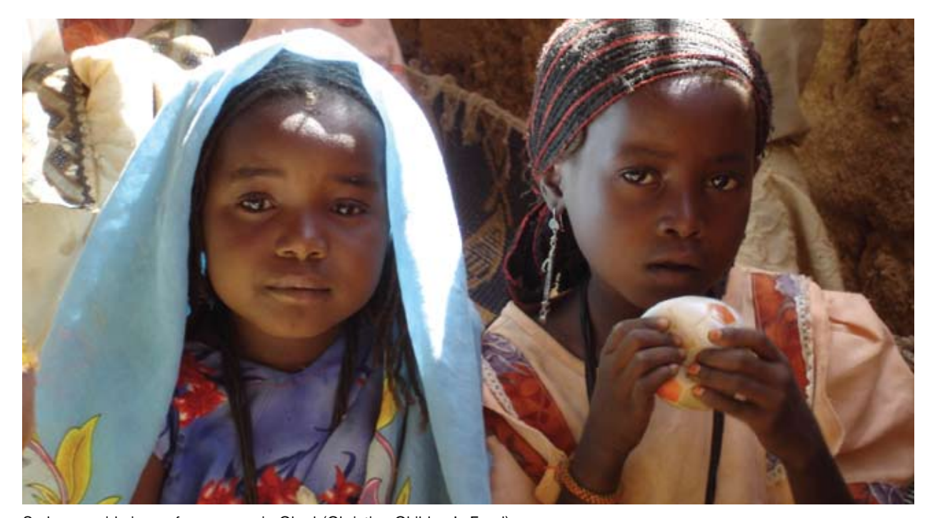
Sudanese girls in a refugee camp in Chad

Islam, including calls by senior government officials for "jihad," to mobilize northern Muslim opinion. Religious incitement by government officials contributed to the horrific human rights abuses perpetrated by government security forces and government-backed militias.