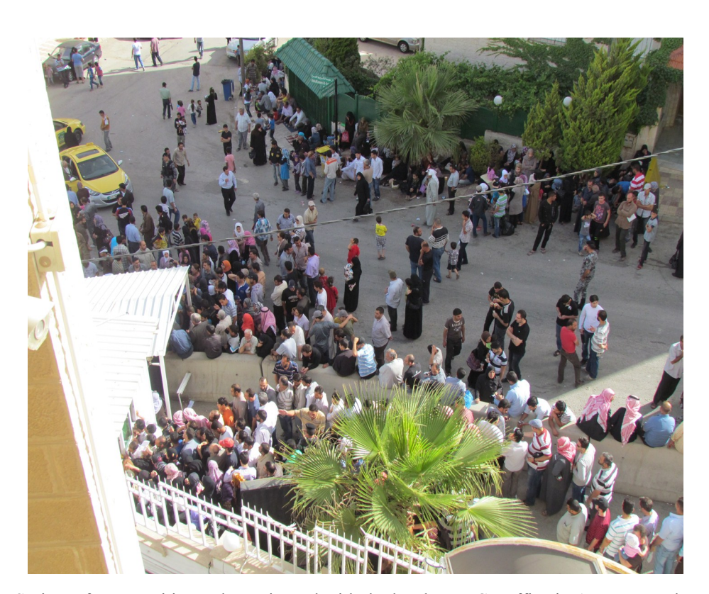
Syrian refugees waiting to be registered with the local UNHCR office in Amman, Jordan, June 2013

As the Syrian civil war enters its third year, the human cost of the conflict is growing exponentially. According to the UN, as of July 2013 more than 100,000 Syrians are dead, more than 4.5 million are internally displaced, and more than 1.7 million are refugees in neighboring countries. By the end of 2013, more than half of Syria's population, over 10 million people, likely will need urgent humanitarian assistance.