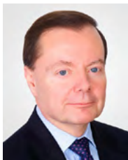
Commissioner Gary Bauer