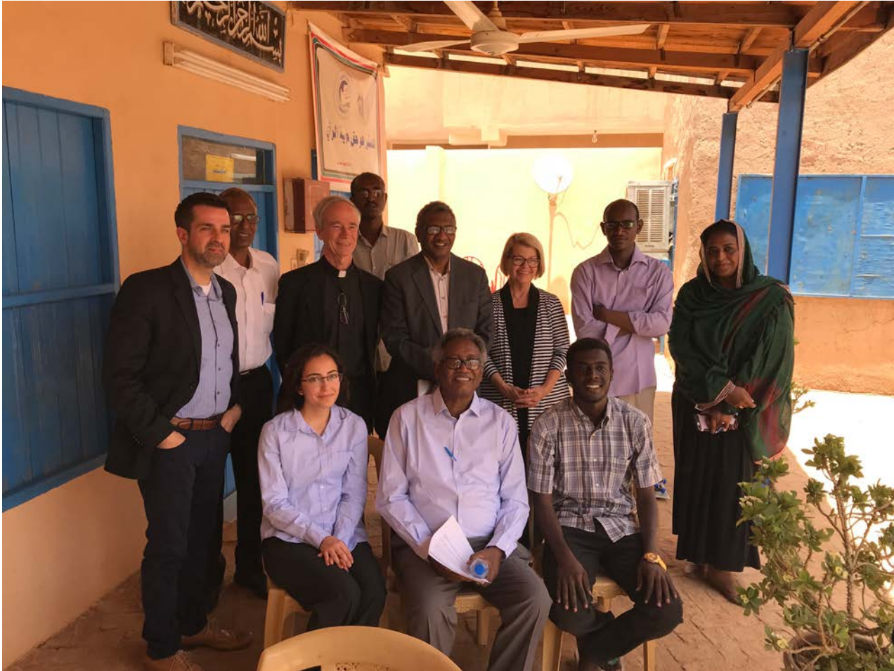
USCIRF delegation visiting the Mahmoud Mohamed Taha Cultural Center with members of the Republican Brothers.