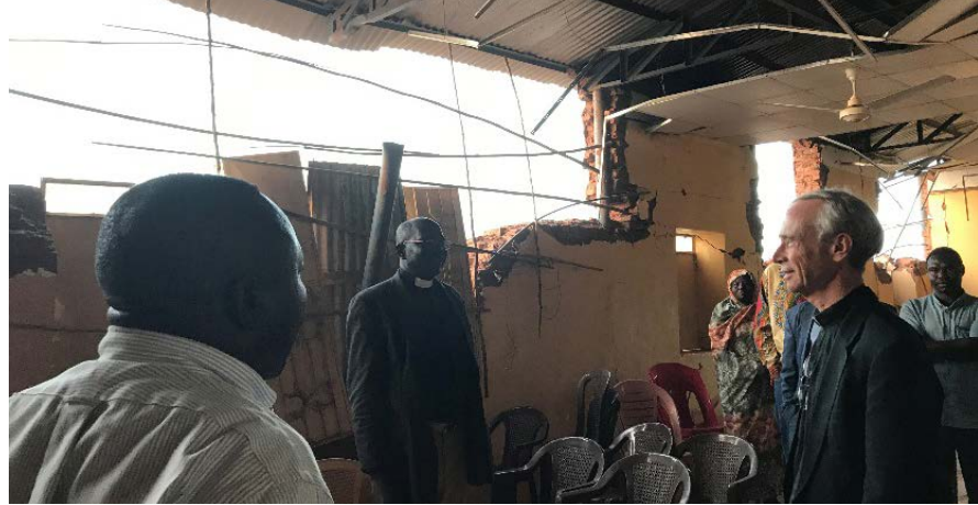
SCOC members show USCIRF the interior of their partially-destroyed church in Soba Al Aradi. One wall has been reconstructed in a makeshift manner, and members still worship there. When authorities came to demolish the church, Christian and Muslim neighbors ran out to protest and attempted to block the demolition.

allegedly tortured Christians. He and his family finally fled from Sudan in fear for their lives, but now dread the repercussions that other human rights defenders remaining in Sudan may face in continuing their work.