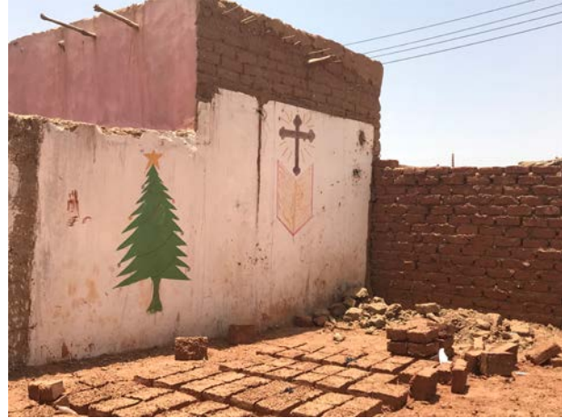
(L) USCIRF stands in front of a former Sudan Evangelical Presbyterian Church (SPEC) church demolished in February 2018, where a new wall was erected along the perimeter of the property. (R) Remainder of a wall inside the destroyed SPEC church.