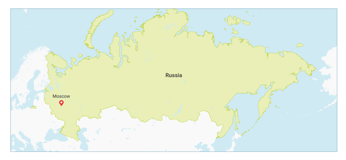
The Anti-Cult Movement and Religious Regulation in Russia and the Former Soviet Union (2020)