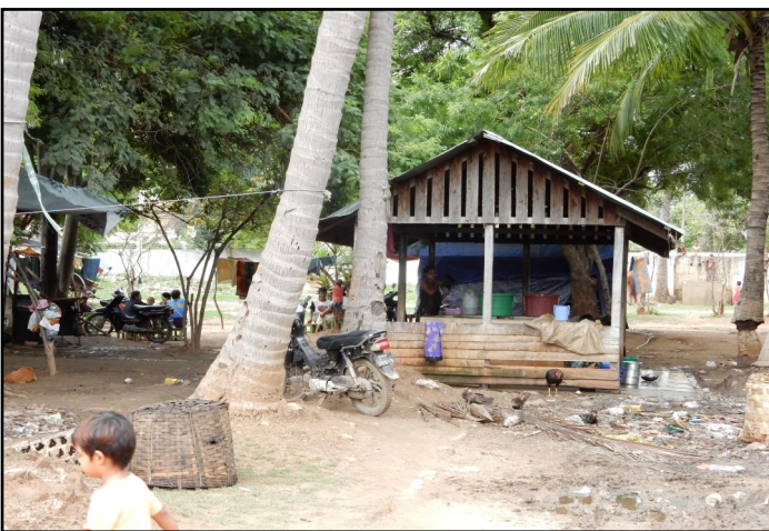
In Meiktila, USCIRF visited a camp for internally displaced Muslims who lost their homes in the March 2013 episodes of communal violence.

USCIRF also examined the circumstances surrounding the anti-Muslim violence that spread throughout the city of Meiktila in March 2013. Representatives from the