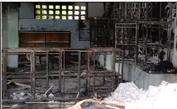
A mosque located in the Muslim section of a Mandalay cemetery was burned during communal violence. Several other structures were burned as well.

At a moment in which political leaders should be expressing strong support for tolerance, Burma’s upcoming 2015 elections instead have created opportunities for demagoguery. And indeed, the Commission heard expressions of deep concern that government officials were supportive of anti-Muslim sentiment in an effort to burnish their credentials among possible voters as the true defenders of Buddhism. In short, some of USCIRF’s interlocutors expressed concern that political figures in Burma do not want to appear empathetic to Muslims. As a result, there are incentives for all political figures – including moderates – to display chauvinism. While a broad coalition of political leaders taking a stand against the politicization of religion might enhance the prospects for an end to such chauvinism, the likelihood of such a coalition emerging at this point seems inconceivable.