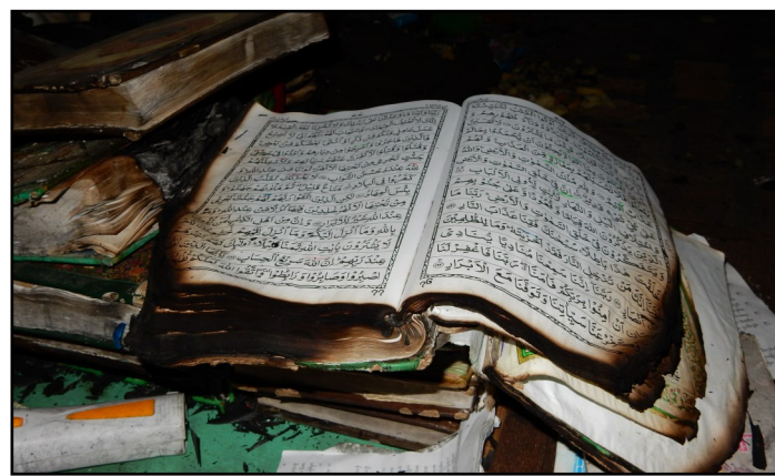
A Koran burned in a mosque fire during the July 2014 communal violence in Mandalay.

Inter-communal violence in Mandalay in July 2014 provided an example of this unfortunate phenomenon. USCIRF visited Mandalay to examine the circumstances surrounding the mobs that killed two men, injured several others, and vandalized property, including the burning of a mosque and several Korans inside. This incident demonstrated how nationalistic monks and other extremists, with the complicity, or at least the relative indifference of the central and state government, could spread unsubstantiated rumors through social media for the sole purpose of fomenting widespread unrest. After a blogger posted a story about an alleged rape, which later was proven to be fabricated, several other websites picked up the story and the extremist monk Wirathu, known for his leadership within the 969 movement, posted it to his Facebook page. Within a day, violence broke out.