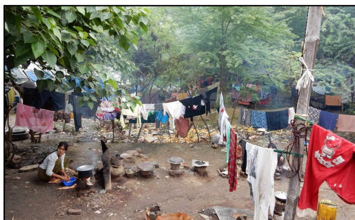
Also in Meiktila, USCIRF visited a camp for Buddhist displaced persons.

Meiktila District Administrative Office spoke of their plans to relocate the displaced from what they referred to as rescue camps and even insisted on showing USCIRF the new homes constructed for some of those being relocated. Yet USCIRF was disappointed to see that 18 months later, thousands of Muslims and Buddhists left homeless by the violence and fires that swept through the city still remain in displacement camps. The Commission visited two such camps and is concerned about the prolonged period in which people remain in conditions of displacement.